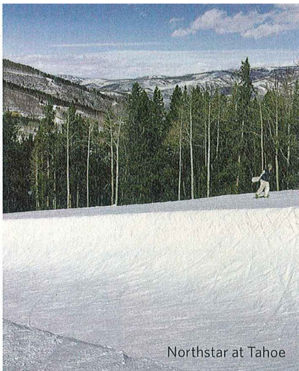
Northstar at Tahoe

FAMILY FUN: When you ski together as a family, you'll really appreciate the Mellow Yellow zones—beginner/intermediate slopes that are dedicated "go slow" zones, so you don't have to worry about crazy-fast skiers knocking your kids down. At night, head into the village for ice-skating at the outdoor rink —fire pits on the perimeter keep you warm (and you can buy s'mores kits and toast your treats over the flames). Big Wave Burritos and Wraps (530-562-8800) and Rubicon Pizza &